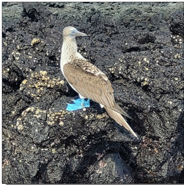
Blue footed booby, Chinese Hat, Galapagos

Library of Congress (in the legislative branch). FRD helps other agencies with research and evaluation needs.