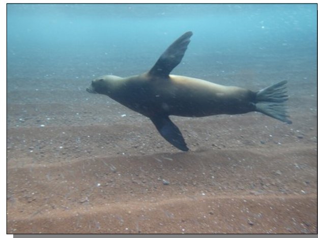
Sea lion, Rabida Island, Galapagos