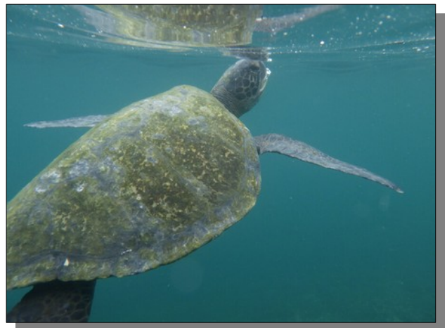
Sea turtle, Tagus Cove, Galapagos