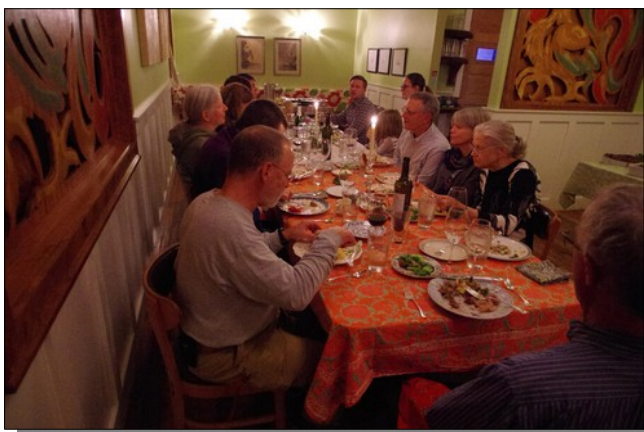
Thanksgiving in the Melon