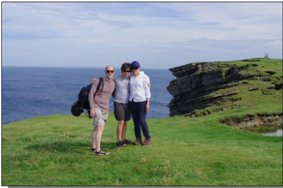
Brough of Birsay

In the fall, we headed down to Richmond and met up