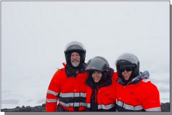
Snowmobiling in Iceland

It started out as a bucket list year! Shortly after last tax day, we headed to the airport for a trip Sarah arranged to Iceland. There were some issues with the Iceland air flight so our first planned day we actually spent at the Smithsonian's Dulles Air and Space Museum. But the flight did eventually get us to Reykjavik and back on our planned itinerary, though we missed the famous blue lagoon, planned as a recovery stop after arriving. We saw icebergs up close from a zodiac, rode snowmobiles over glaciers and found a very nice, less touristy hot spring lagoon to relax in. Along the way, the scenery really was otherworldly. (See kayakero.net/link116 )