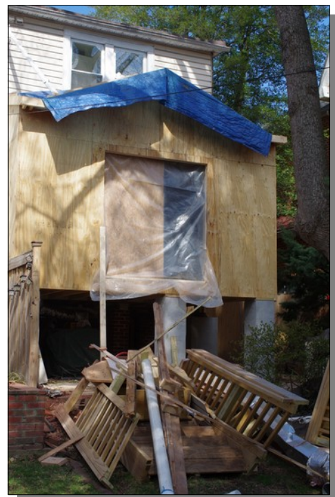
Expanding the addition a bit