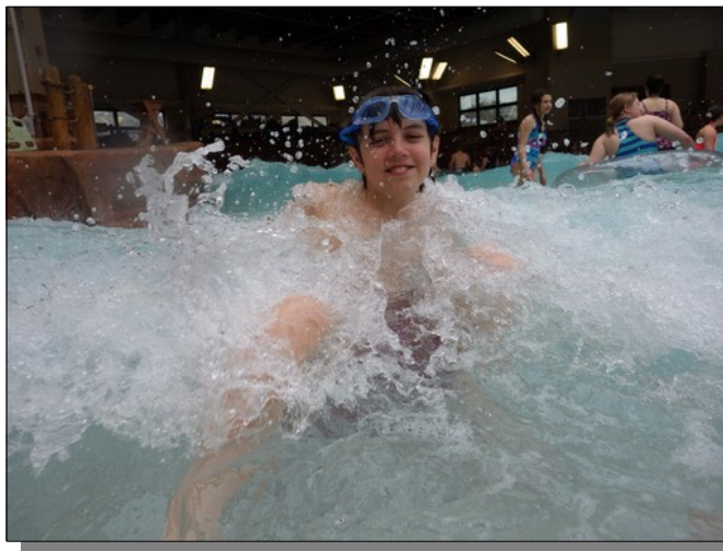
Wilderness at the Smokies water-park; March 2016

Mountains National Park ( kayakero.net/link79 ). That trip wraps up this past tax year.