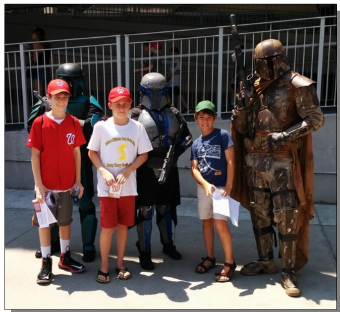
Star Wars day at Nationals Park; July 2015