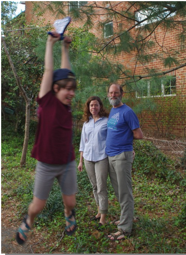
We set up the zipline in the backyard last summer.